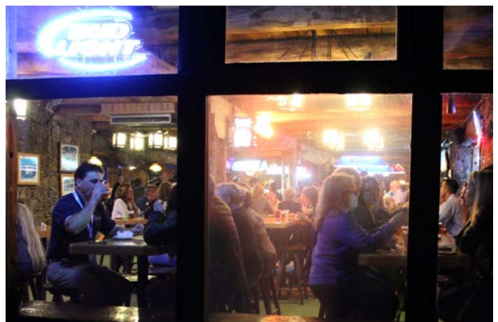
The ever-popular Networking Reception at the Foggy Goggle Lounge was provided courtesy of sponsor PerformCare, Harrisburg.