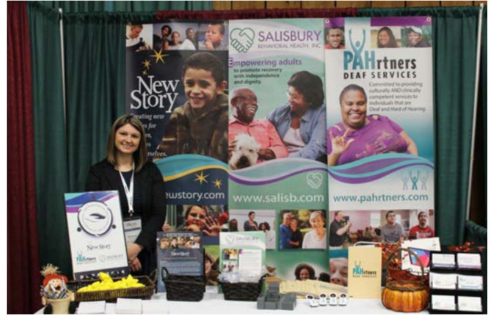
Salisbury/New Story/PAHrtners was selected best in show in Exhibit Hall and will receive a discount to return in the 2015 conference.