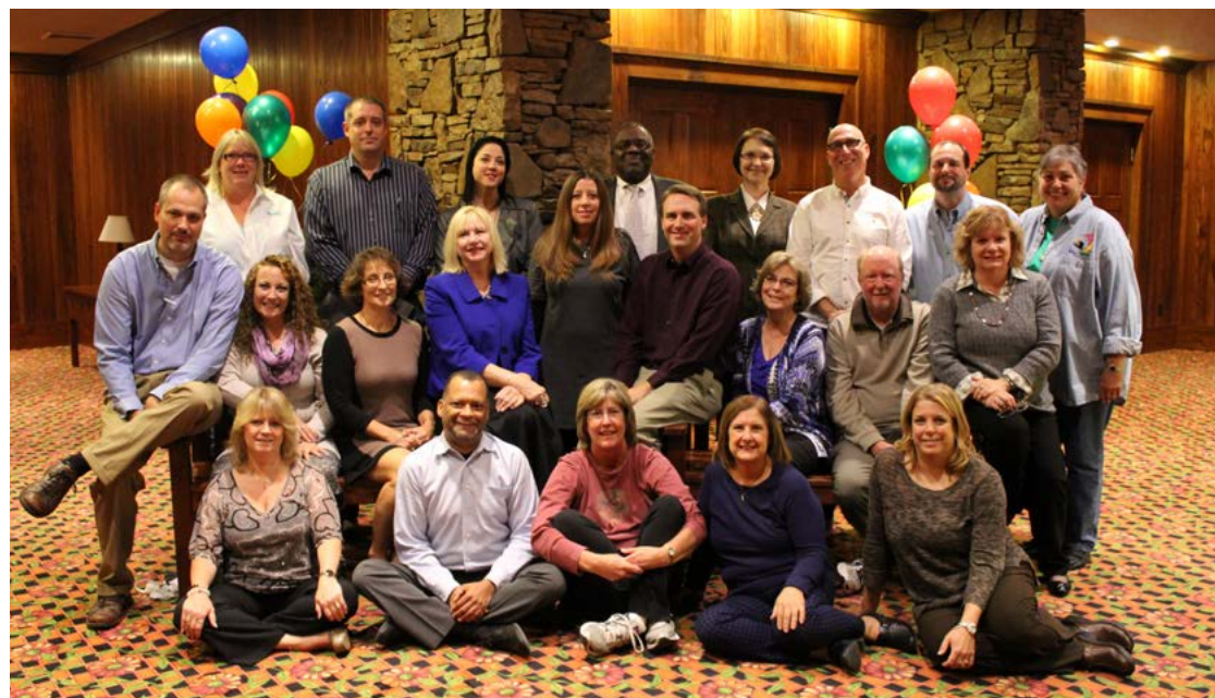
The association extends its deepest thanks to the Conference Committee for its exceptional planning and hosting of the 2014 event.