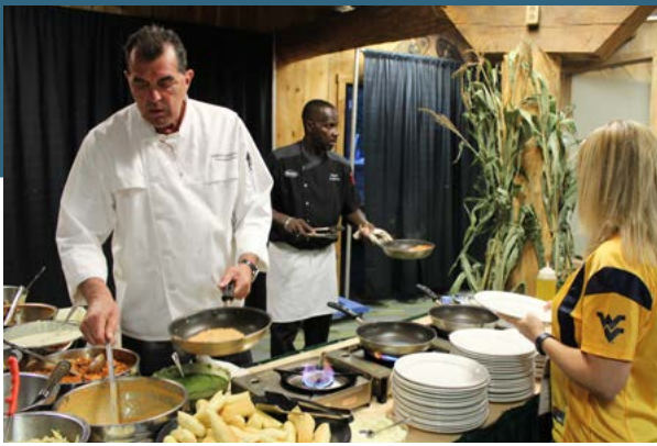
The Italian pasta bar and grill was a favorite station at RCPA's new event – the Taste of the Nations dinner.