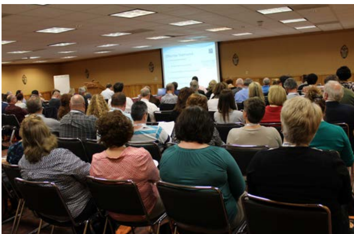
A record-breaking crowd eagerly participated in 55 workshops, three plenary sessions, and a film screening in addition to the keynote.