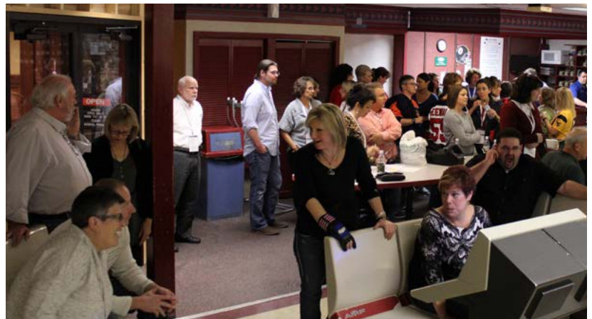
Spectators and teams alike enjoyed the PAC Bowling Tournament Thursday night.