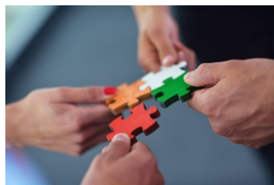
Business Interruption and COVID-19