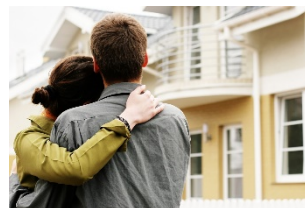
The Case for Estate Planning, Under Any Circumstance

©2020 Gibbel Kraybill & Hess LLP | 2933 Lititz Pike, Lancaster, PA 17606