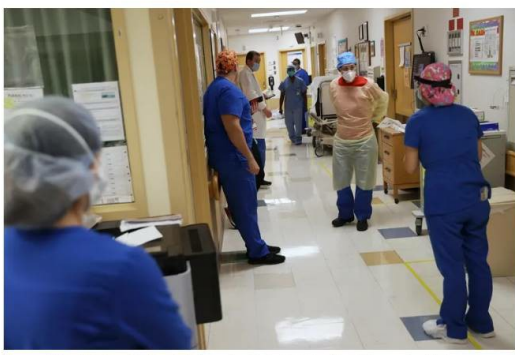
Nurses at Temple University Hospital, shown here in April 2020, will get the opportunity to earn bonuses for working overtime under a proposal by Temple manag

Thousands of relatively inexperienced nurses have received raises from area health systems in a bid to prevent them from leaving for lucrative sign-on bonuses at other hospitals.