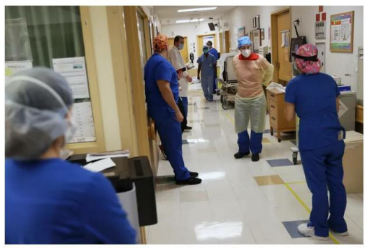
Nurses at Temple University Hospital, shown here in April 2020, will get the opportunity to earn bonuses for working overtime under a proposal by Temple manag